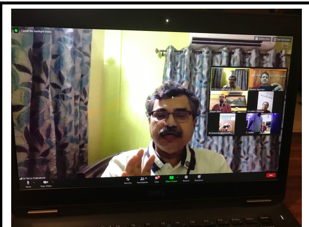
2 nd Jul: Doctor's Day