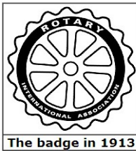
The badge in 1913