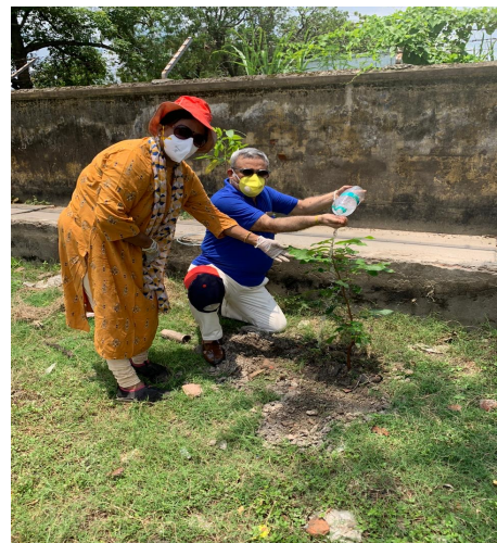
18 th Jul: Tree Plantation