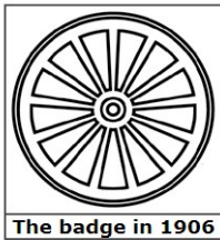
The badge in 1906